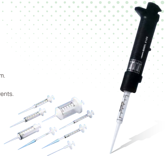
Syringes for 8100