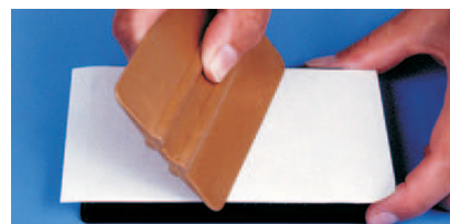
Cat. No. 250050